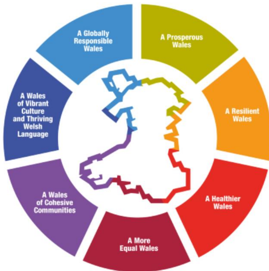
Figure 1: 7 Wellbeing and Future Generation Goals

1.8.1. The Well Being of Future Generations (Wales) Act (WBFGA) gained Royal Assent in April 2015 and sets out seven well-being goals which all public bodies are required to work to achieve. The seven well-being goals are shown below: