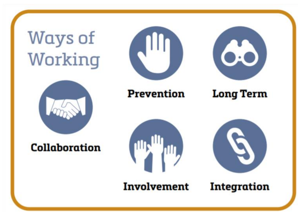
Figure 2: 5 Ways of Working