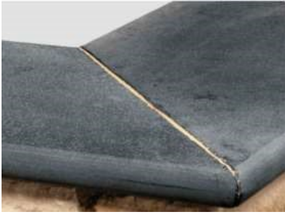
Basalt Road Kerb Stones