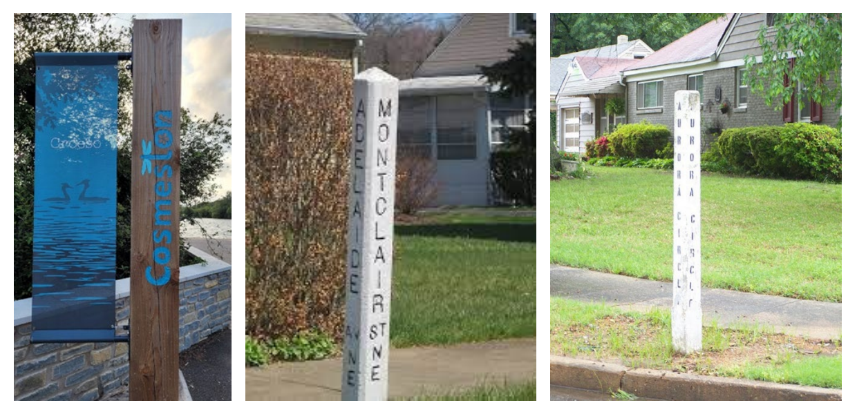
Posts so text can be on one, or more sides

Can be wood posts or vinyl on a steel frame.