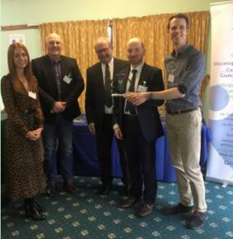
Blaenavon Town Council